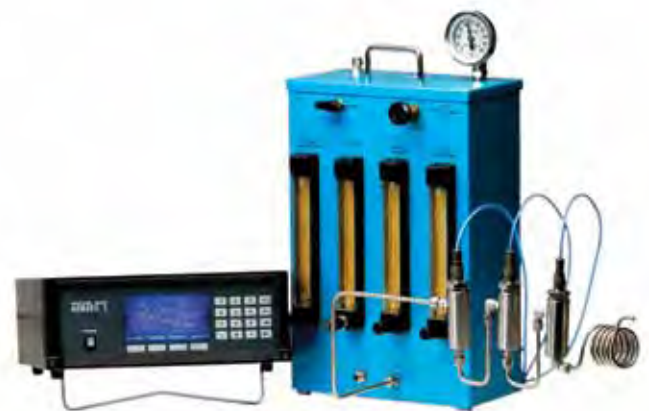
MG101 with Moisture Image® Series 1 analyzer to demonstrate moisture sensor calibration